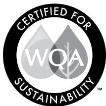
Figure 4-2: WQA's Sustainability Mark.

developed by a WQA task force of environmental experts, consultants, regulators, manufacturers, industry professionals, and other stakeholders.